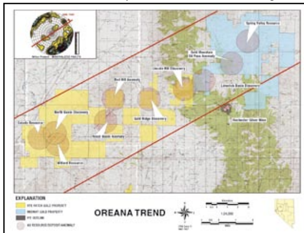
Rye Patch Gold properties in Nevada dominate the newly discovered Oreana Gold Trend that is believed to encompass more than 20 million ounces of gold.