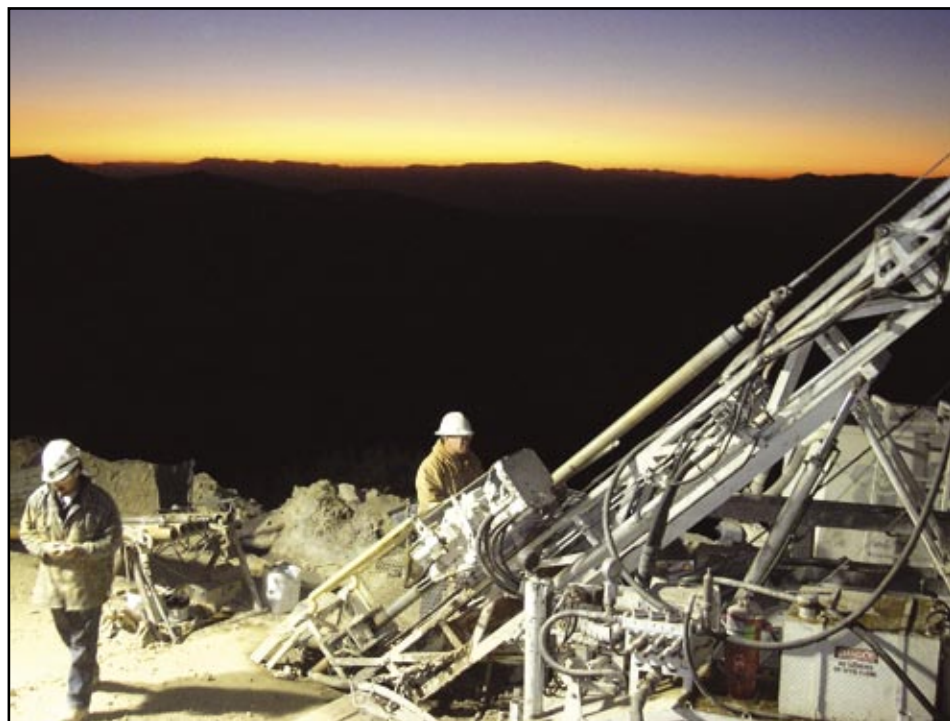
Rye Patch Gold plans aggressive drilling programs to build its gold resource inventory and potentially discover new mineralized zones on its Nevada properties.

The company has designated $1.4 million for continuing exploration at its various projects this year. Some