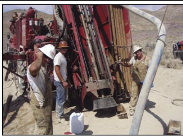
Rye Patch Gold will spend $1.4 million exploring its Nevada gold/silver properties this year: $500,000 at Wilco, $500,000 at Lincoln Hill, $300,000 at Jessup, and $100,000 at Gold Ridge.

New discoveries at Gold Ridge, Lincoln Hill, and along the Oreana Trend are expected to boost the company's resource inventory significantly. To date, drilling indicates there is substantial mineralized gold